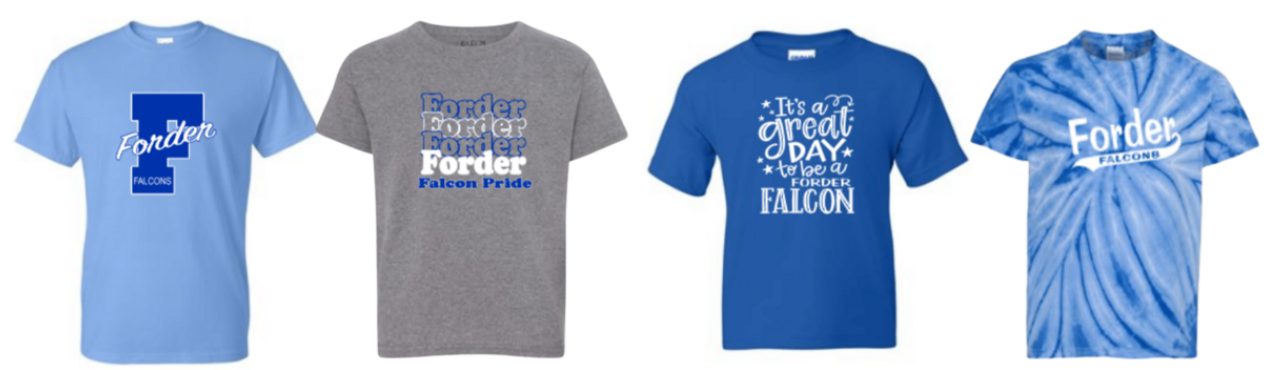
Check out the website for even more designs and colors!